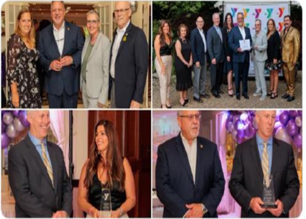
3:52 PM · Jul 11, 2023 · 293 Views

Honored and grateful to receive the Soundview YMCA's 2023 Community Partner Award! This award recognizes our ongoing collaboration with the Y to provide quality programs and services for our students and families. We appreciate their support and dedication to our community.