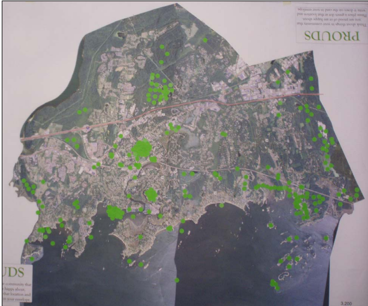
Location of “Prouds”

The detailed compilation of comments based on the submitted cards is presented on the facing page.