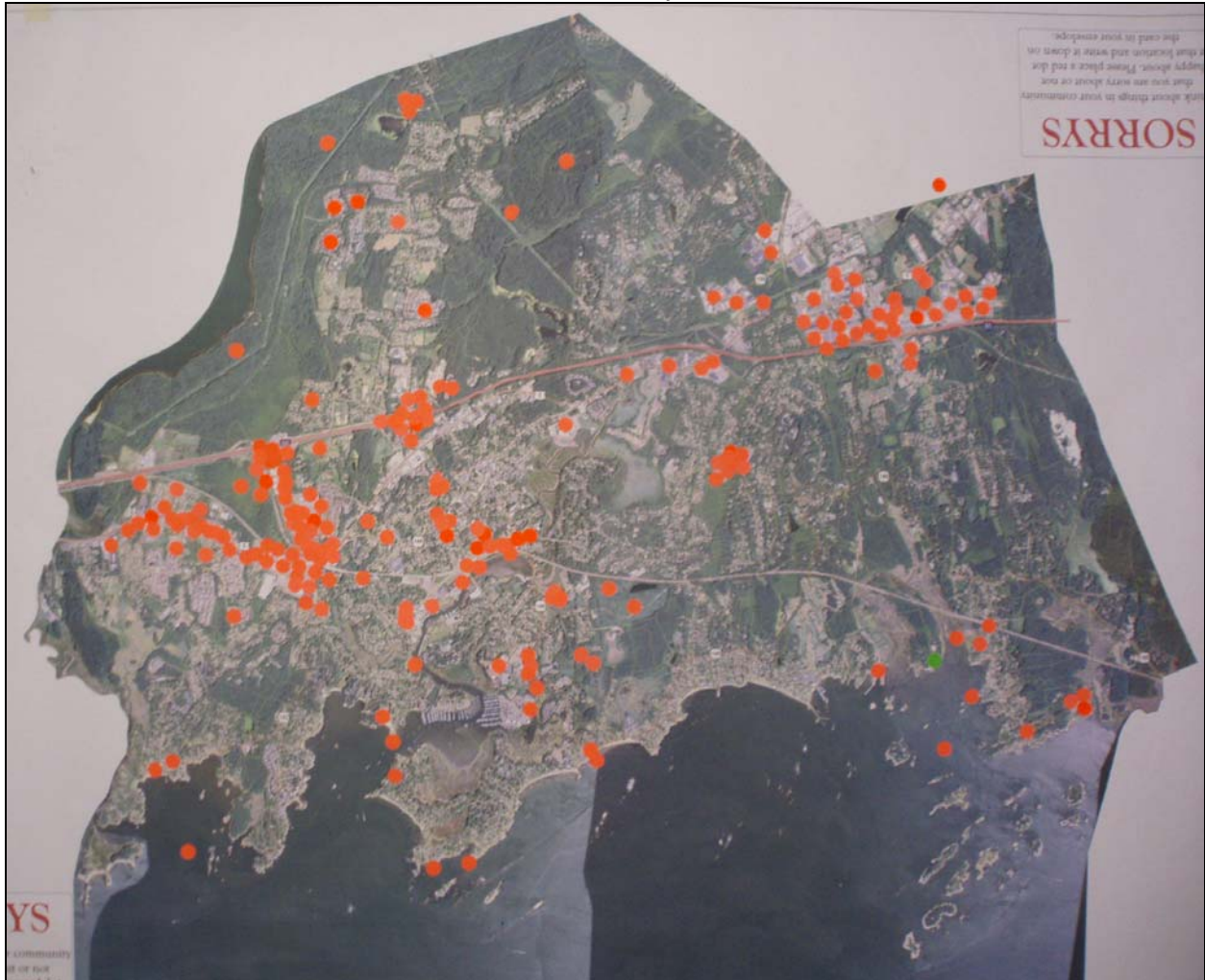
Location of “Sorrys”

The detailed compilation of comments based on the submitted cards is presented on the facing page.