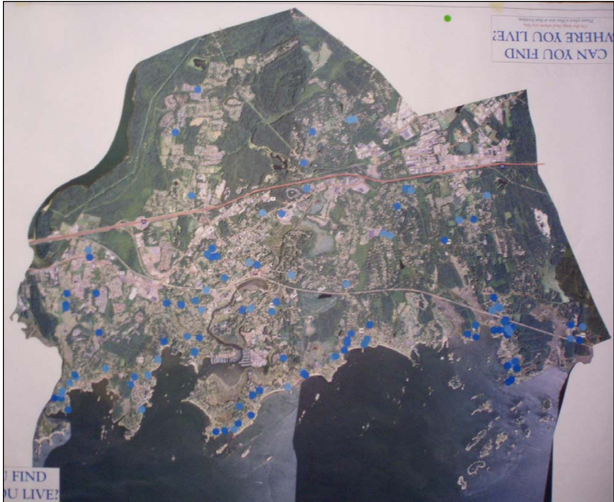
Where Attendees Lived

The distribution of dots seems to indicate that residents came from different parts of Branford and that there did not seem to be a geographic bias which might have skewed the results of the meeting.