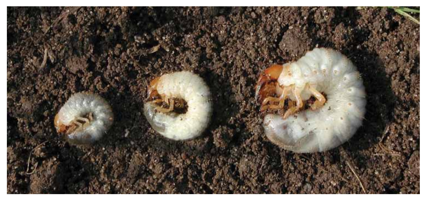
White grub species, left to right: Japanese beetle (Popillia japonica), European chafer (Amphimallon majalis), and June bug (Phyllophaga sp.)

grub species require moist soil for their eggs to hatch and young grubs are very susceptible to desiccation. Watering during adult beetle activity in the early summer attracts egg-laying females. The different species have somewhat different life cycles, but most eggs are laid in June or July. Because organic lawn management minimizes watering, egg-laying females tend to be less attracted to these lawns. However, once the larvae begin to eat and grow in late August, the grass becomes more susceptible to drought and the larvae become more resistant to it. Usually the soil moisture increases in September as the weather cools. If not, some watering may be warranted. Higher moisture at this time is helpful for any grass that might be damaged, but it also increases biological activity in the soil. At this time of year,