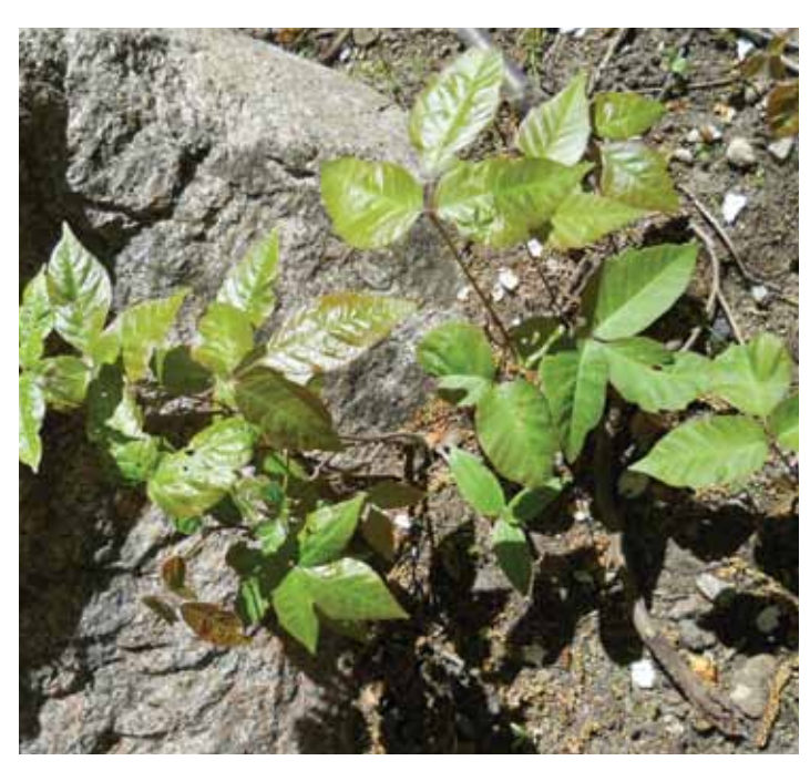
Photo: Poison Ivy (Toxicodendron radicans)

can make the urushiol airborne and injure your lunas. There are organic herbicides available to kill poison ivy, however, they kill the leaves and require repeated applications to weaken and eventually kill the plant itself. There are lotions available you can apply to your skin before and after working in your yard that are designed to block and remove urushiol. If you plan to hand-pull it, make sure you protect your skin and clothes from coming in contact with any part of the plant by covering them with non-absorbent gloves, boots and suit. Be very careful not to touch with your bare skin any item that has come into contact with any part of the plant. Hand-pulling is not a good idea if you are sensitive to poison ivy. It is, however, an effective way to keep it controlled. If you are sensitive, engage someone else to hand pull it in early spring and fall. As with all weeds, it is easiest to control when small. When hand pulling, be sure to remove as much of the root as possible. Do not let poison ivy climb, because that is when it flowers (and spreads seeds). If it has gotten established in trees, cut it off at the base and do so repeatedly until it is weakened enough to be pulled. Be sure that whoever does this job wears adequate protection.