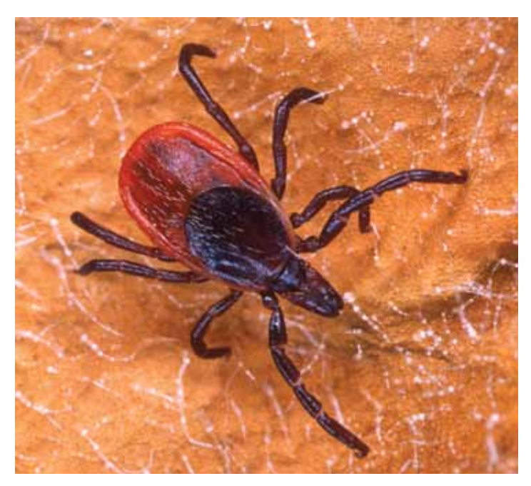
Photo: Blacklegged tick, aka deer tick, female (Ixodes scapularis)

The biggest problem with ticks is not the tick itself, but the diseases it carries. Although there are eleven tickassociated diseases in the U.S., in our area Lyme disease, babesiosis and anaplasmosis (human granulcytic ehrlichiosis) are the most notable diseases, transmitted by the blacklegged tick (Ixodes scapularis), also called a deer tick. The lone star tick ( Amblyomma americanum ), a pest in some areas of the northeast, can carry the pathogen causing erlichiosis (human monocytic erlichiosis). The Tick Management Handbook by Kirby Stafford at the Connecticut Agricultural Experiment Station (see Learn More) is a helpful resource for dealing with tick problems in the landscape.