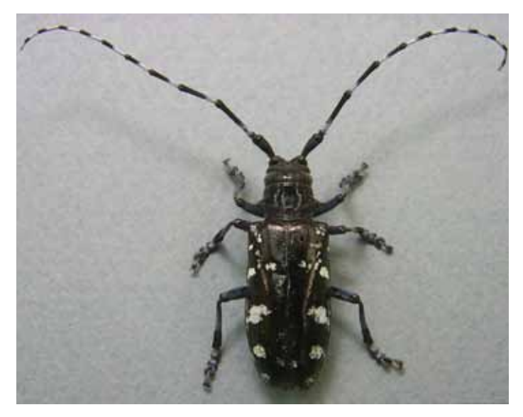
Photo: Asian longhorned beetle (Anoplophora glabripennis)

A very serious threat is the Asian longhorned beetle (Anoplophora glabripennis). This beetle has recently been causing havoc with various deciduous trees including maple species in various parts of the U.S., including the