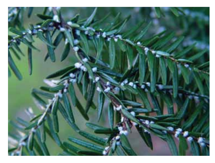
Photo: Woolly Adelgid (Adelges tsugae) Copyright © Christopher Evans, River to River CWMA, Bugwood.org