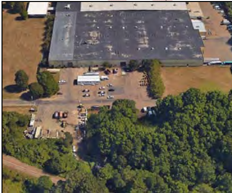
Public Works Facility