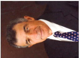
Message from First Selectman DaRos-

Town of Branford 1019 Main Street Branford, Connecticut 06405