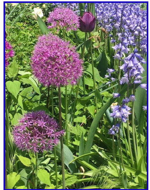
Main Street

When to test/quarantine? Click here to use the: CDC calculator .