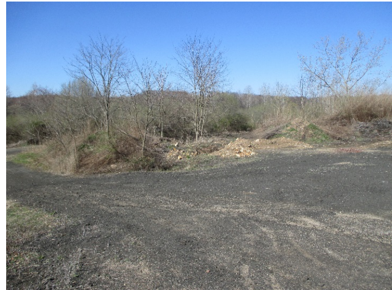
FIGURE 2: PROPOSED PARKING LOT AREA (TABOR DRIVE)