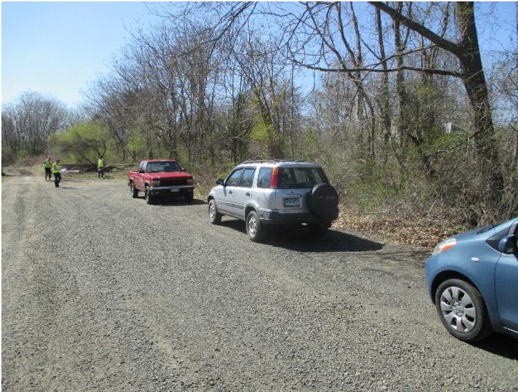
FIGURE 1: PROPOSED PARKING LOT AREA (PINE ORCHARD ROAD)