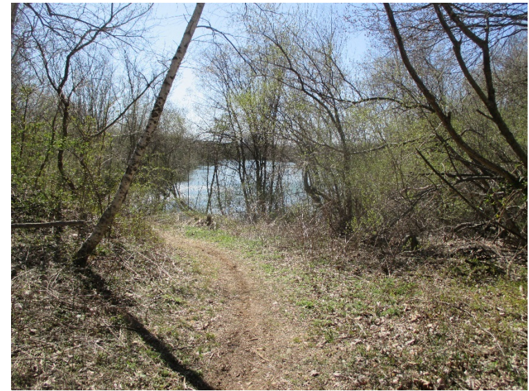
FIGURE 4: SCENIC VIEWS