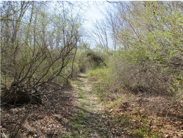
FIGURE 3: EXISTING TRAIL